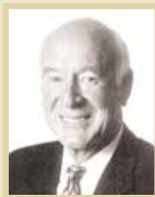
Cecil D. Andrus Gallatin Group